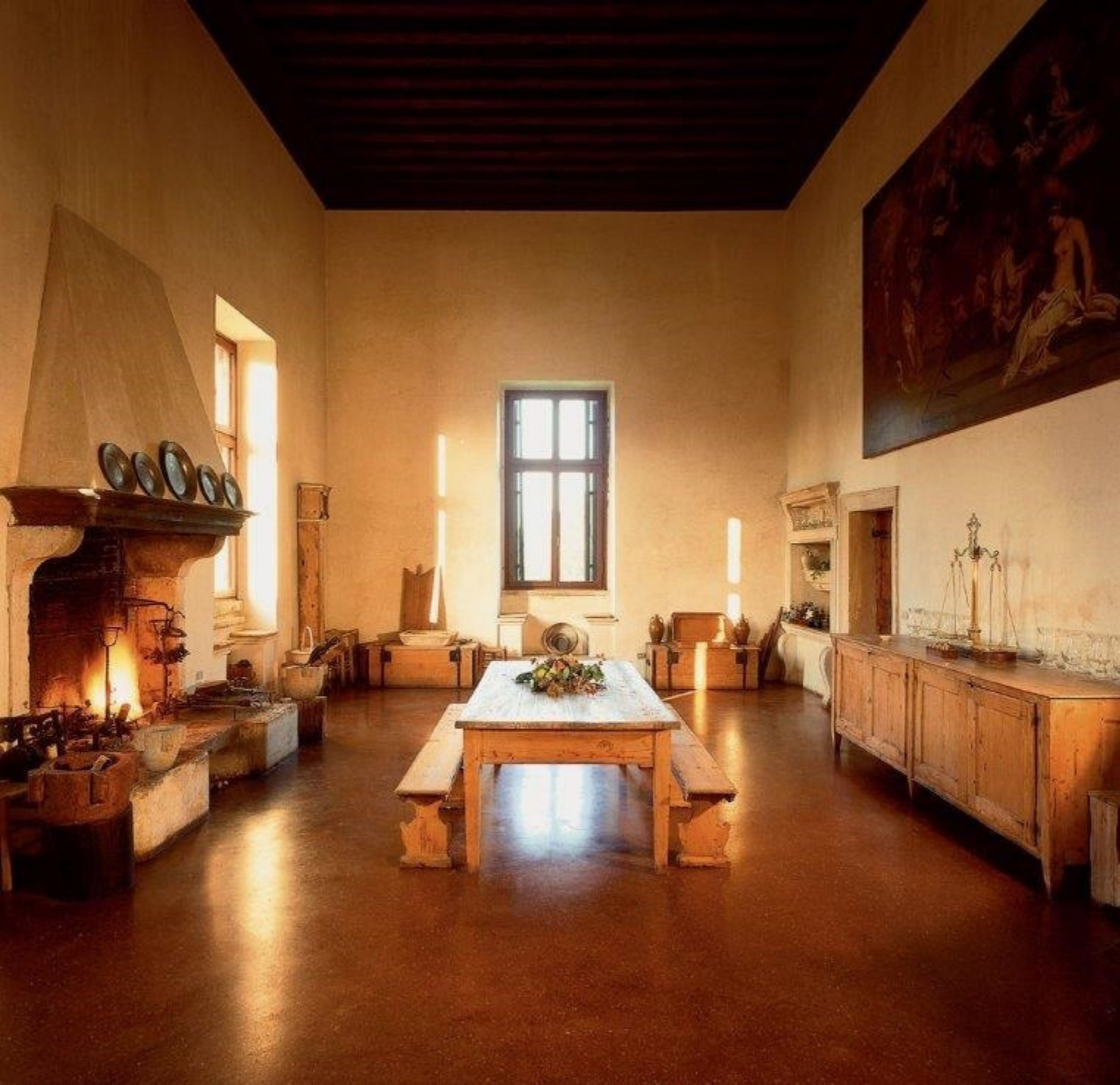
VILLA PISANI BONETTI - IL CUCINONE/KITCHEN