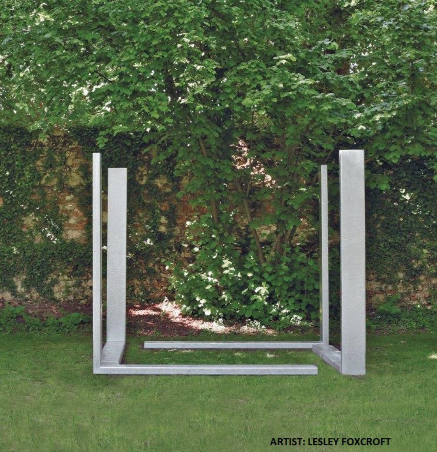
ARTIST: LESLEY FOXCROFT