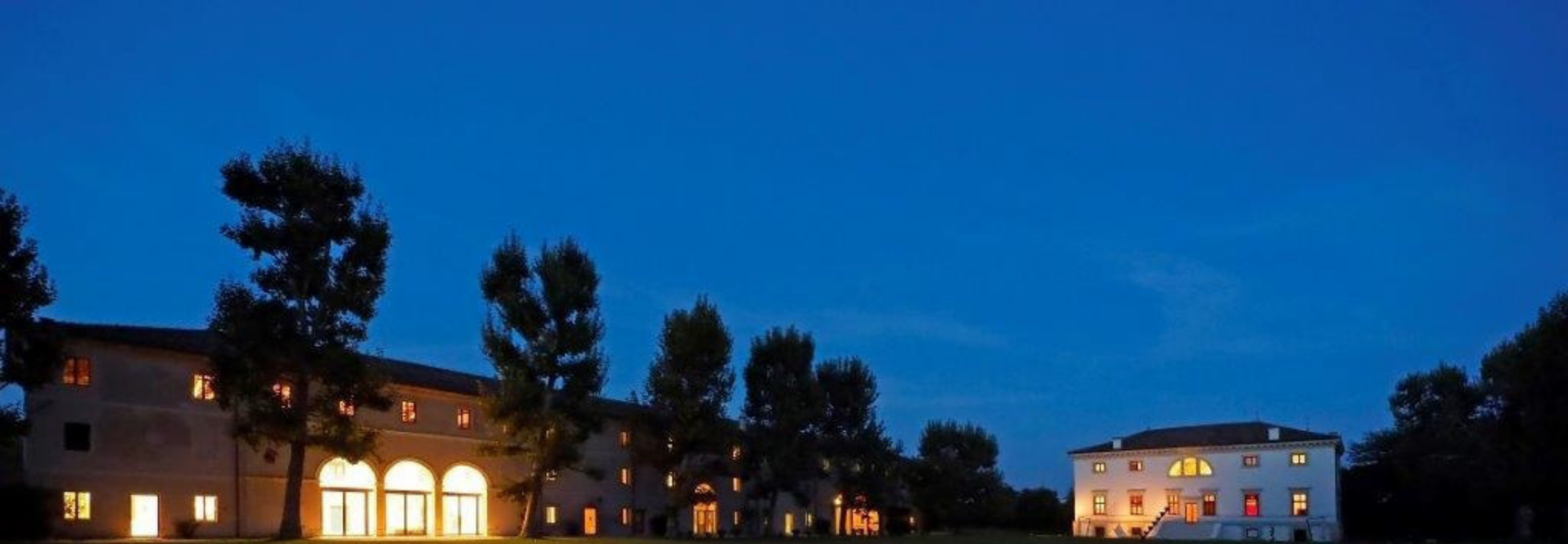
VILLA PISANI BONETTI - BARCHESSA E VILLA