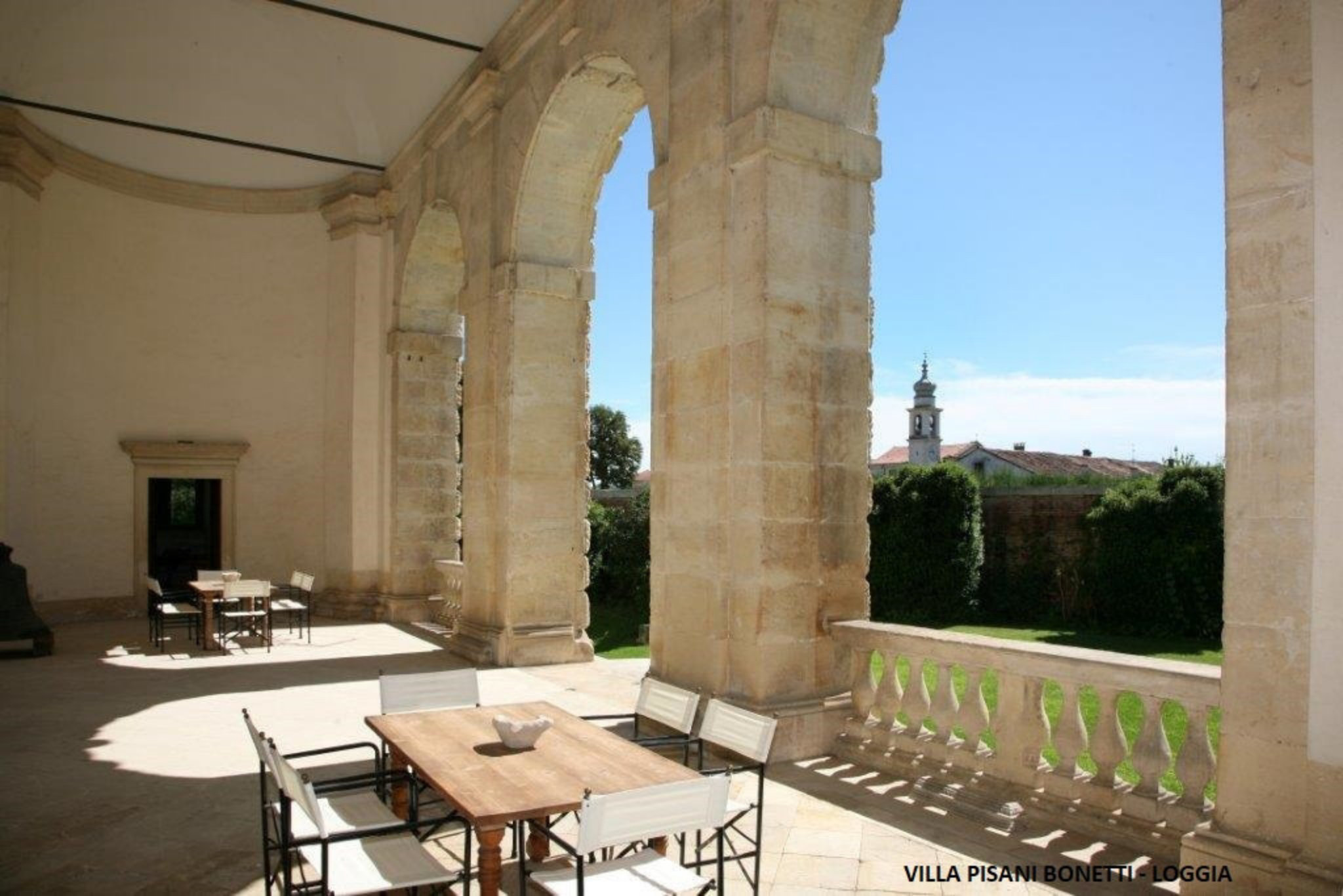
VILLA PISANI BONETTI - LOGGIA