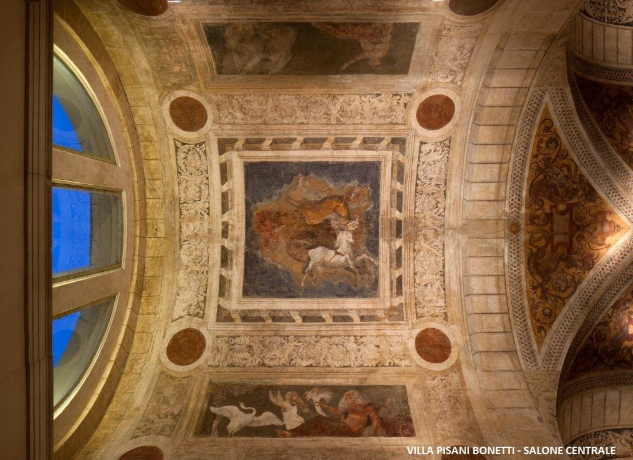
VILLA PISANI BONETTI - SALONE CENTRALE