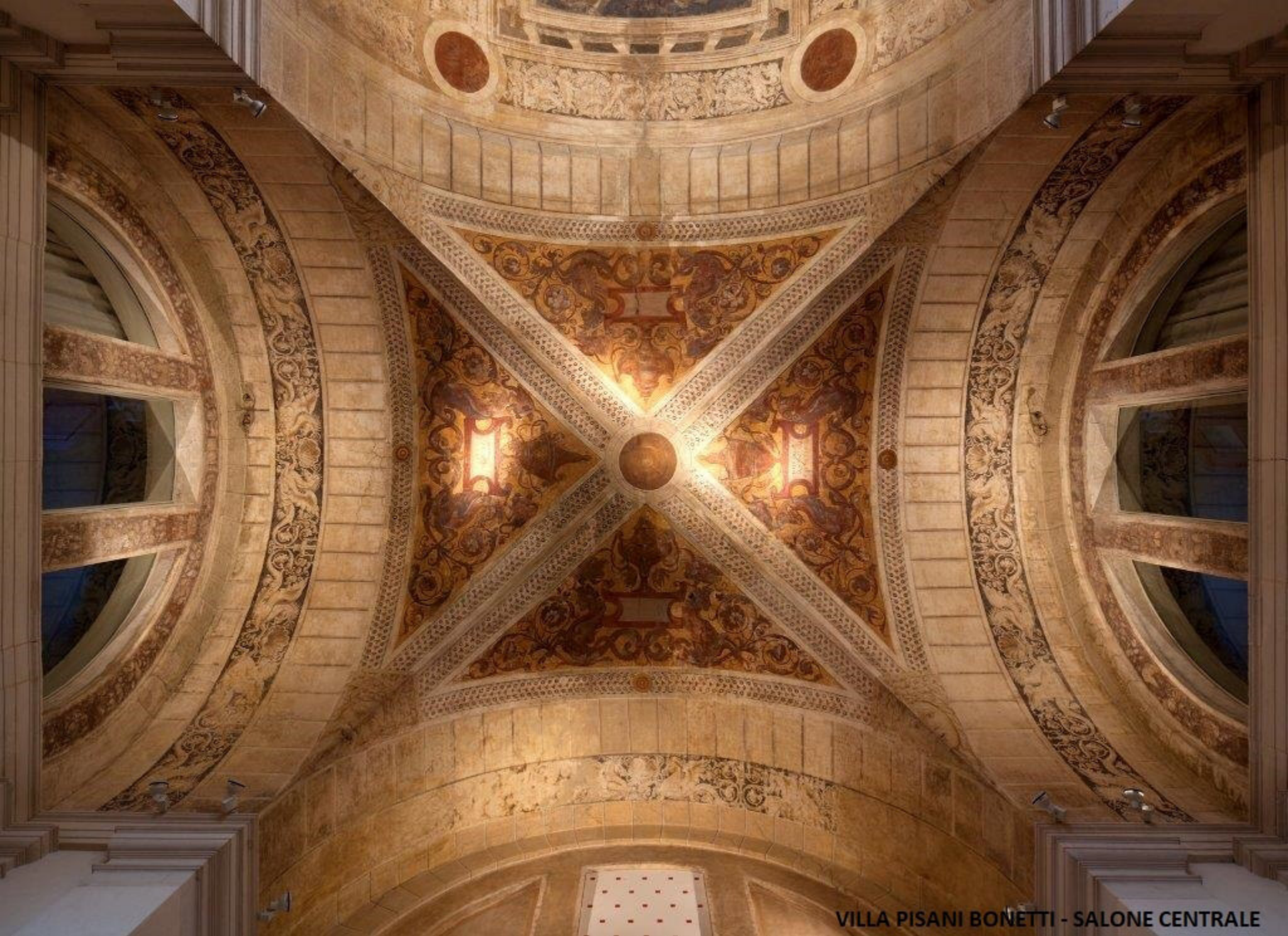
VILLA PISANI BONETTI - SALONE CENTRALE