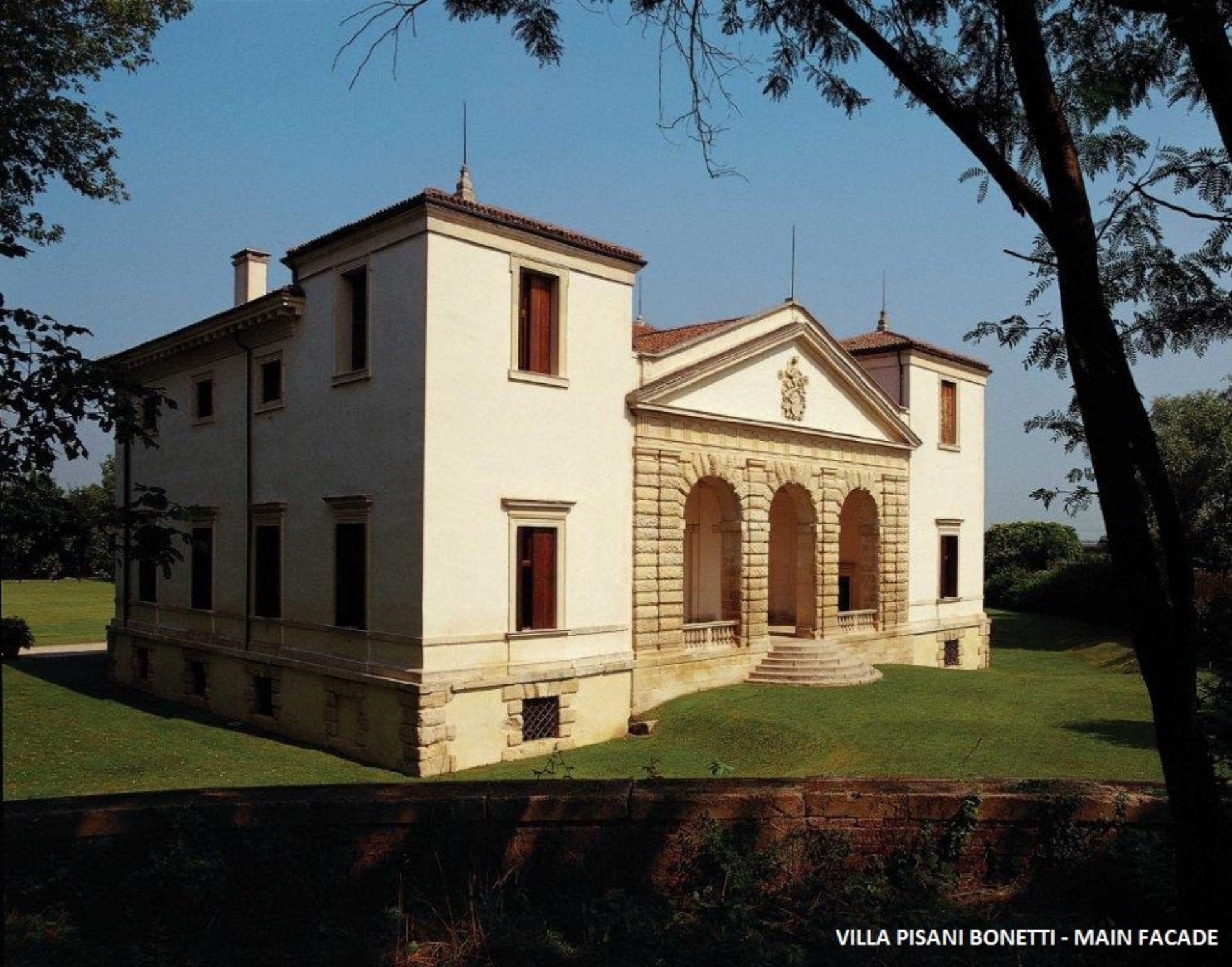
VILLA Pisani Bonetti - MAIN FACADE