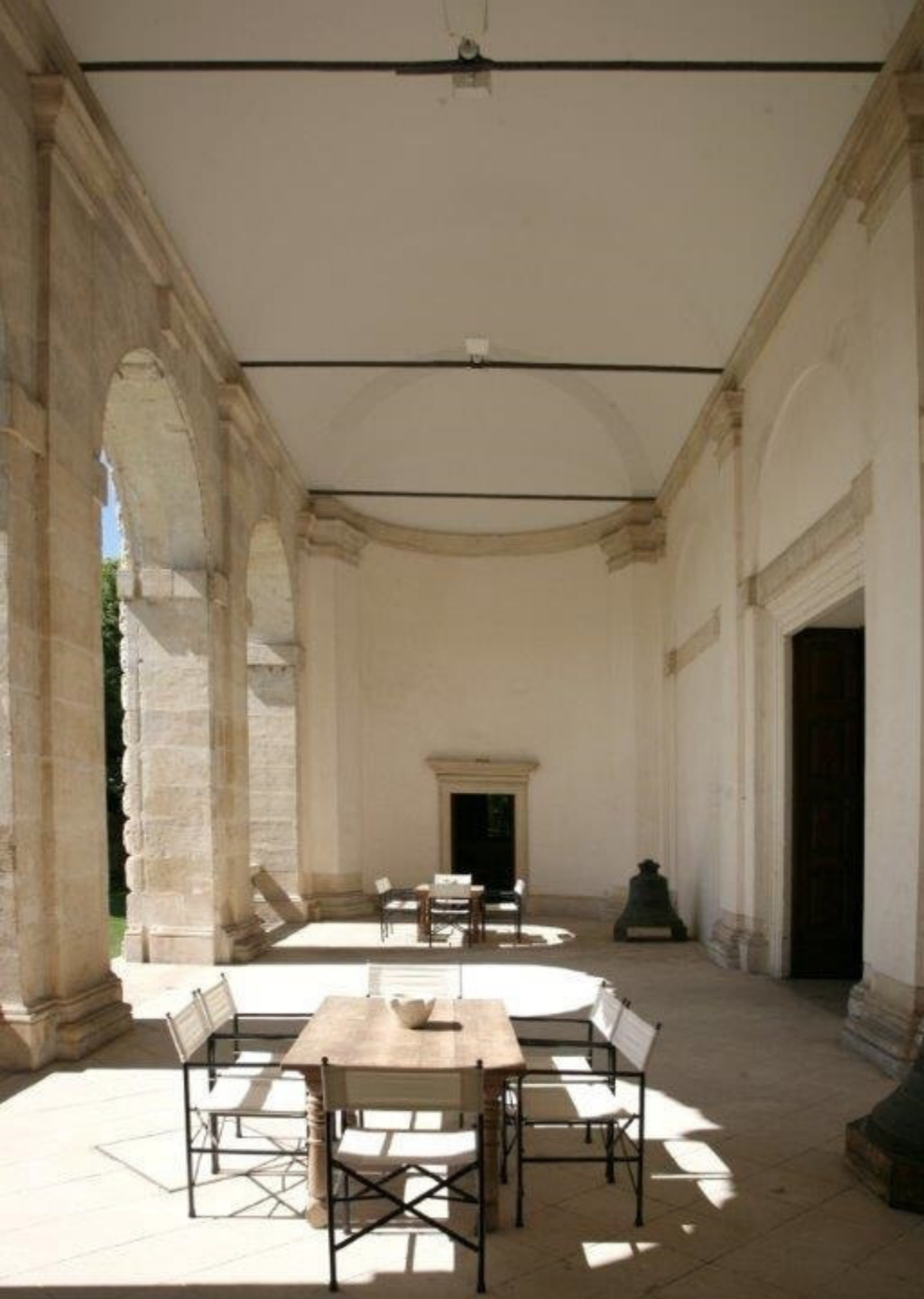
VILLA PISANI BONETTI - LOGGIA